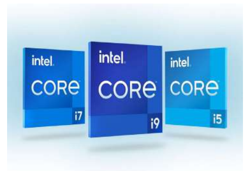
Intel ® 12 th and 13 th Gen Processors

Intel's 13 th Gen Core features a unique dual-core design, featuring P-cores, E-cores, and hyper-threads on P-cores, which introduces a new dimension in multi-core optimization. In response, Intel collaborated with Microsoft to introduce a hybrid-aware scheduler in Windows 11. This allows the operating system (OS) to prioritize fresh cores before tapping into hyper-threads. At the heart of this breakthrough is Intel's Thread Director, a microcontroller within the CPU. It uses machine learning to optimally schedule tasks on the right core at the right time. This allows us to ensure that P-core and E-core are working in synergy. With Windows 11, users can further enhance the performance and efficiency of the CT-MRL01 computer.